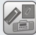
ELECTRIC & ELECTRONICS